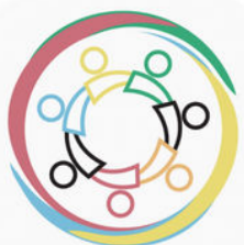
STUDENT ACCESSIBILITY NETWORK

Are you a student balancing studies with parenting or caring responsibilities? This student-led network provides a space to connect with others who understand your challenges, share experiences and resources, and advocate for better support at the University of Southampton.